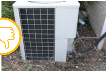
OUTDOOR UNIT SET DIRECTLY ON THE GROUND