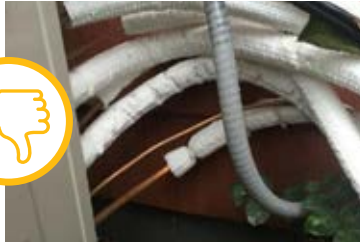
LINE SET/REFRIGERANT LINES NOT COMPLETELY INSULATED