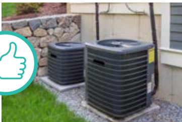
OUTDOOR UNIT INSTALLED IN CLEAR AREA THAT ALLOWS OPTIMAL AIRFLOW THROUGH FAN