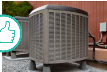
OUTDOOR UNIT SET ON A STABLE, LEVEL SURFACE AND SECURE TO THE PAD USING BOLTS