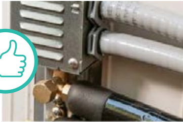
ALL LINE SET/REFRIGERANT LINES PROPERLY INSULATED