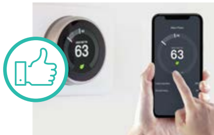
SMART THERMOSTAT WITH OCCUPANCY SENSOR